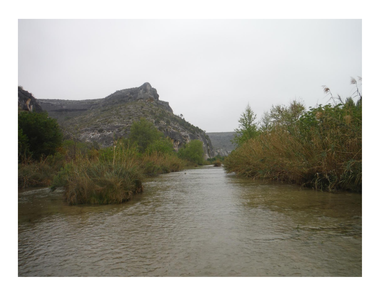
Turkey Bluff is an impressive cliff face at Mile 25.