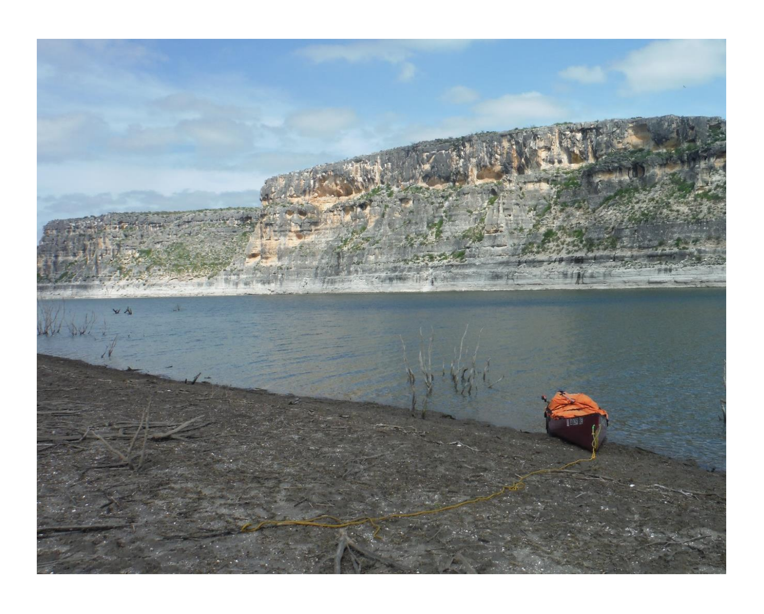
Looking across Lake Amistad at mile 40.