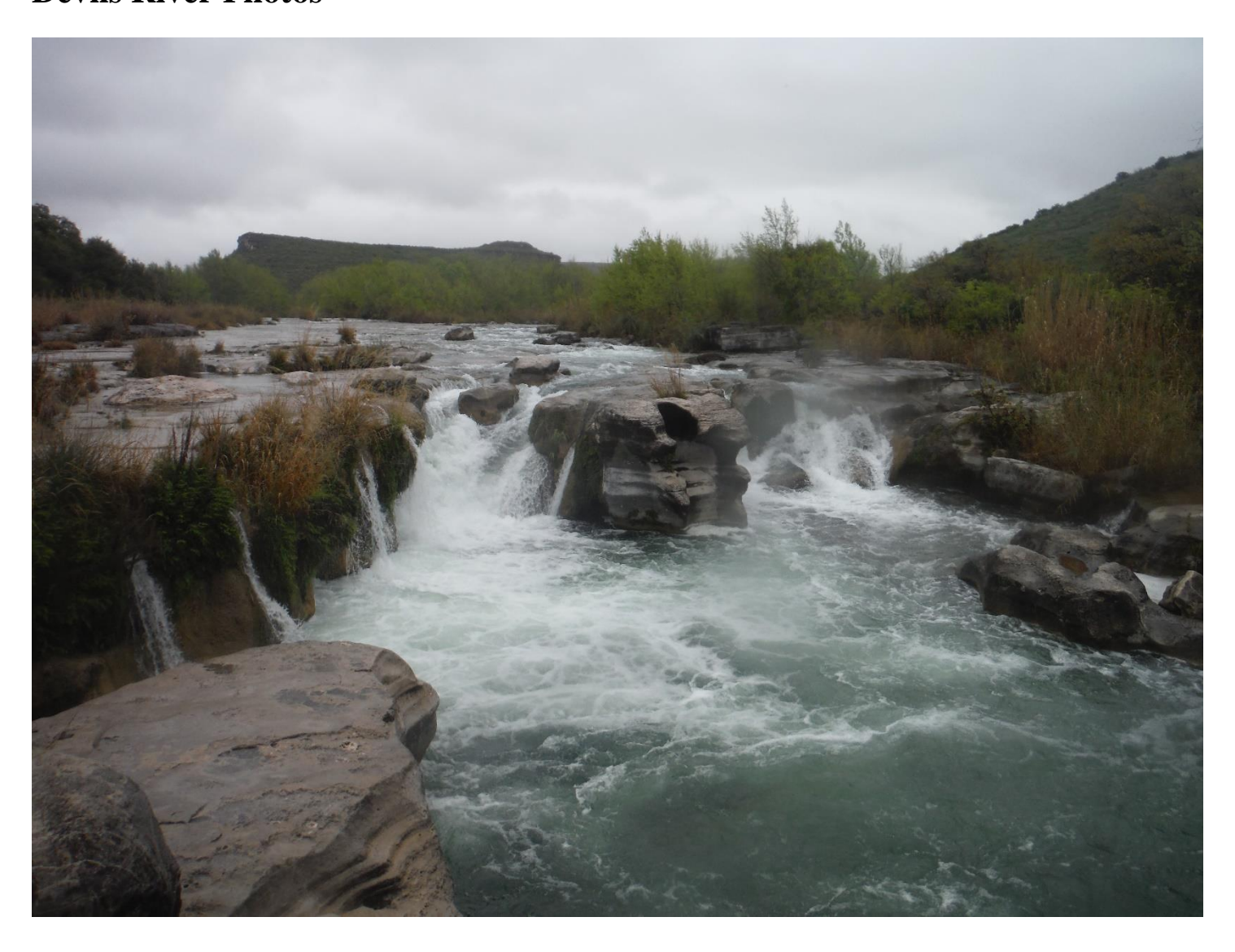
Dolen Falls is located on mile 16. This is the largest, continuously flowing waterfall in Texas.