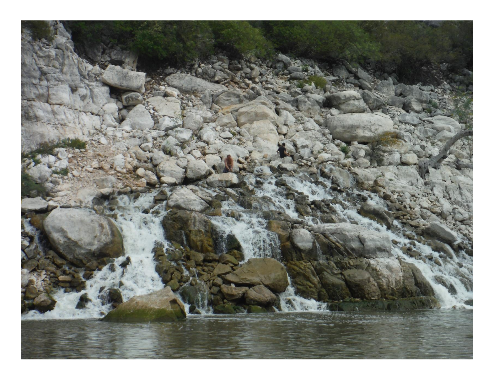
Indian Springs is a massive spring on the shore line of Lake Amistad that is only visible when the lake level is low.