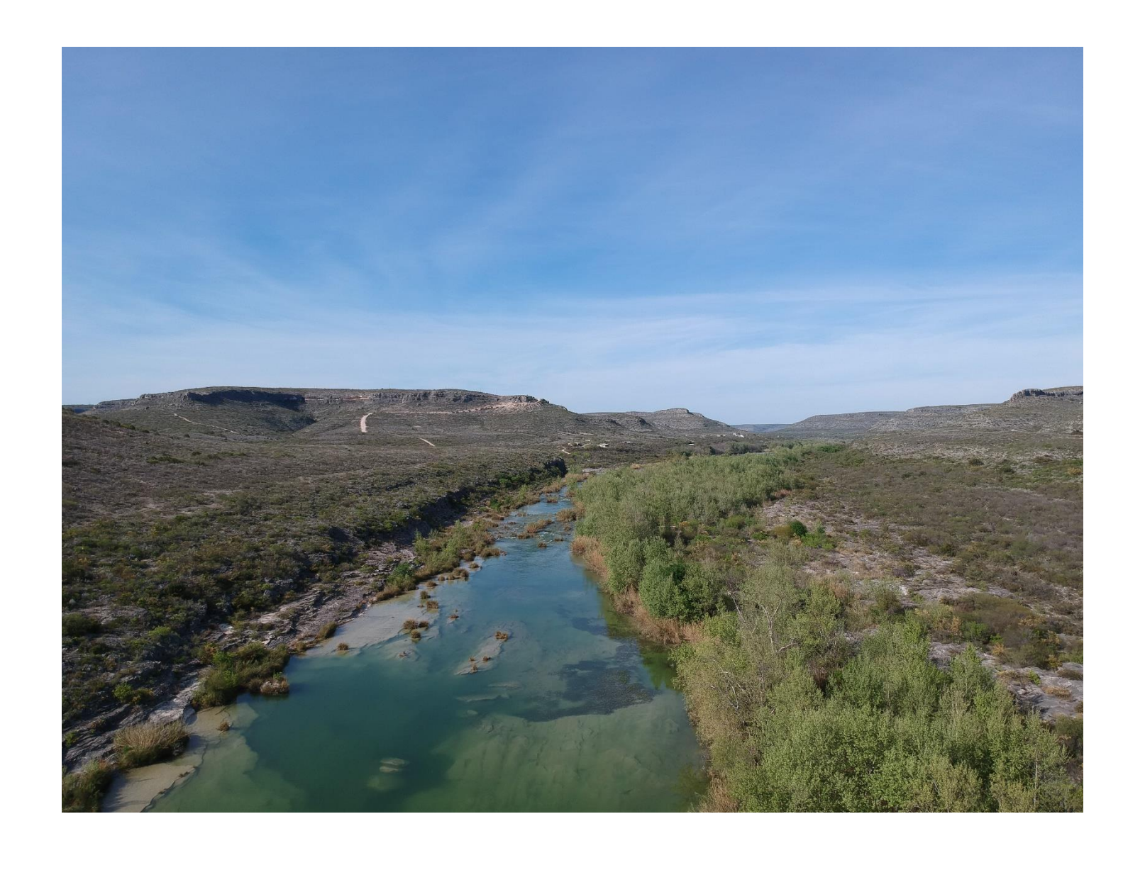
Looking upstream at Rapid #18 at Mile 29. The right shore line is part of the 18,000 acre Devils River State Natural Area (Dan A Hughes Unit)