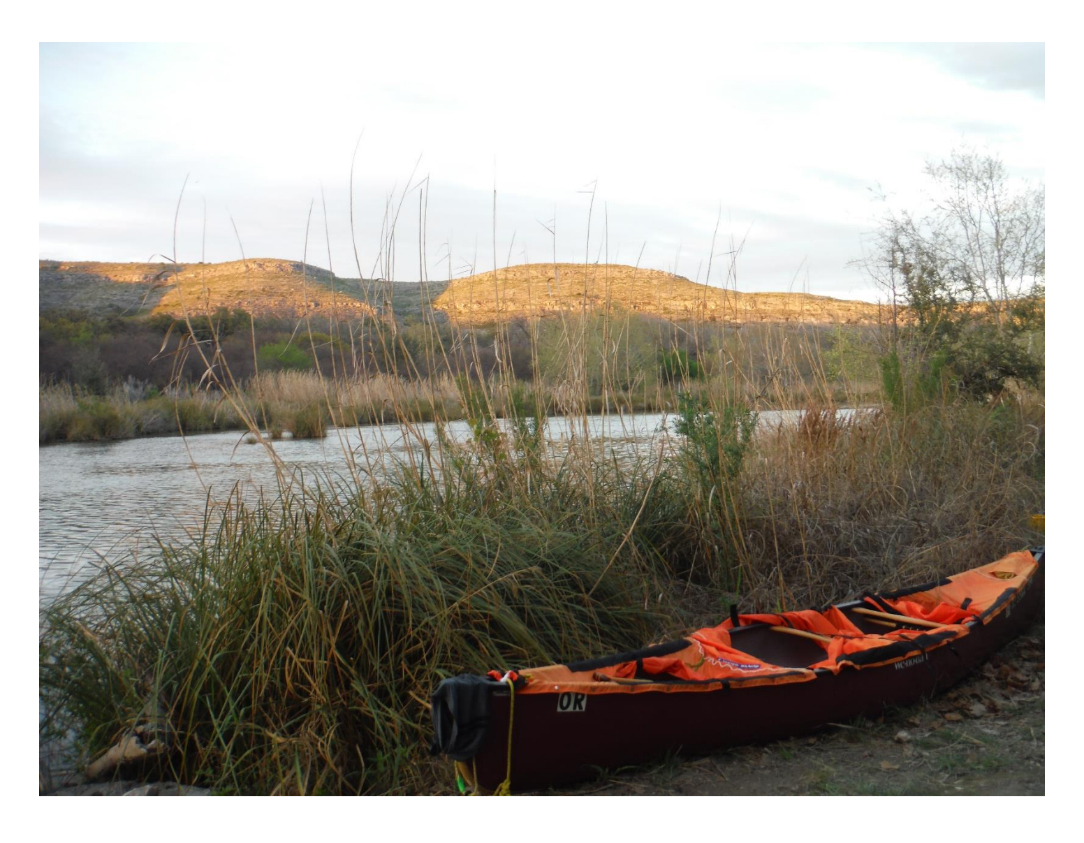
The view from Mile 12 Campsite as the sun sets.