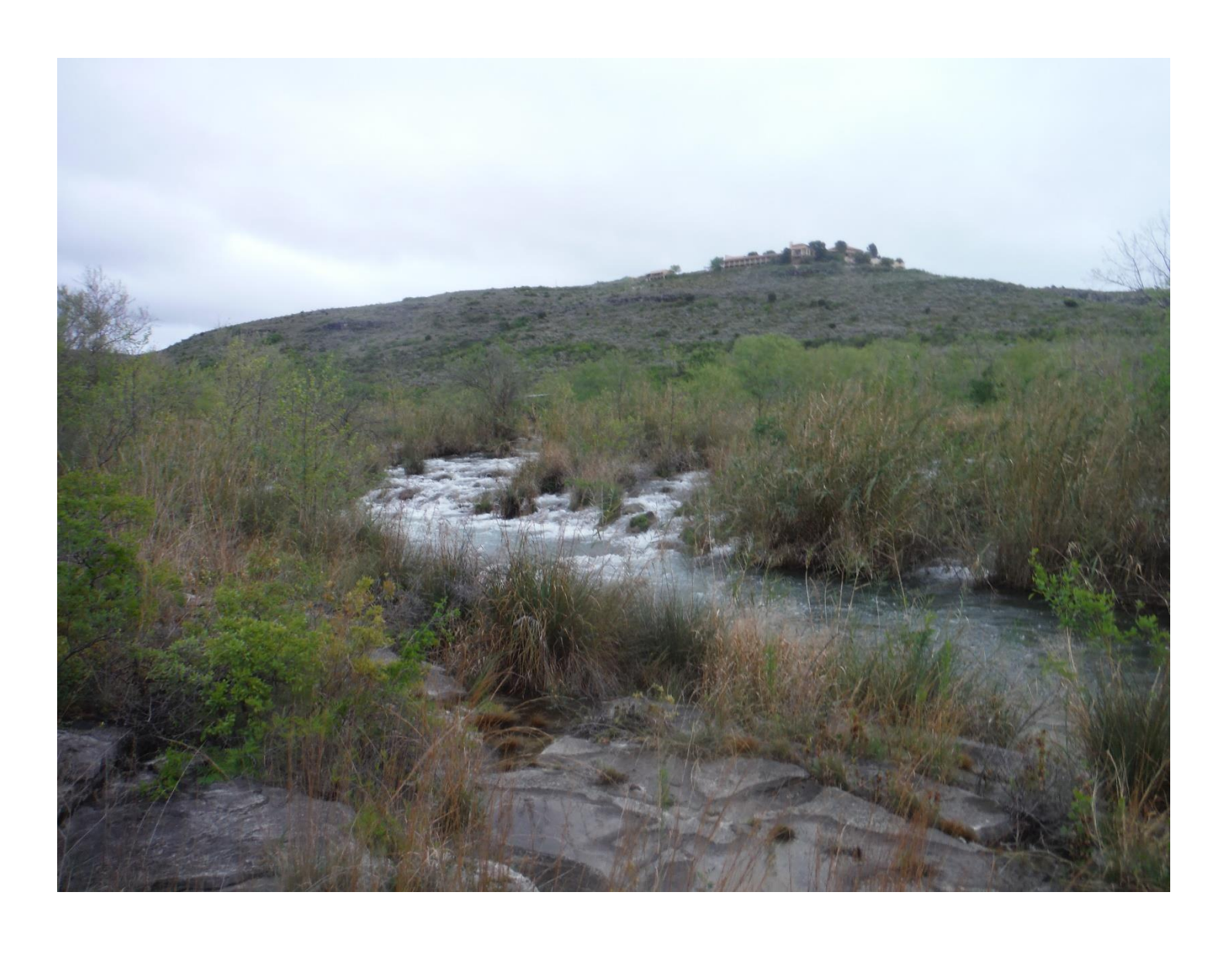
Three Tier Rapid at Mile 17 is complex CIII and it is listed as a "hazard" on the Devil River Texas Paddlers Map.