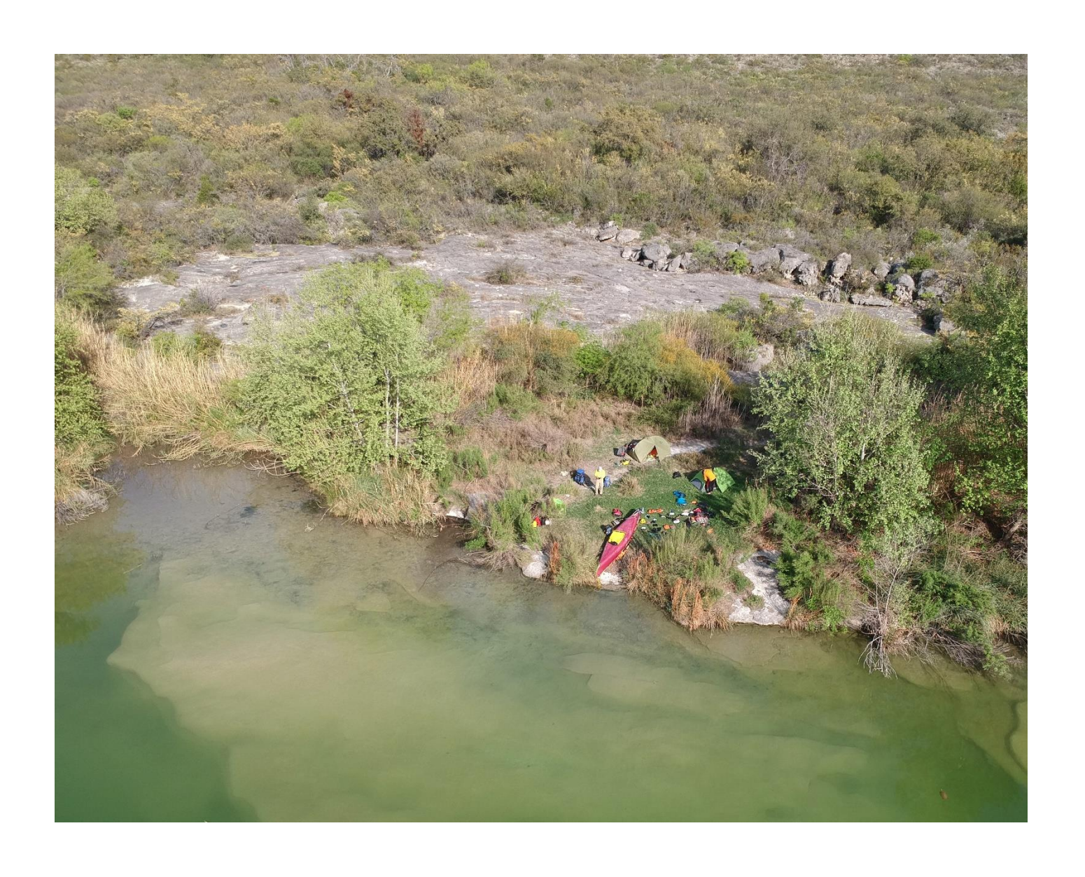
The Mile 29 campsite was a remote location along the shore line of Devils River State Natural Area (Dan A Hughes Unit)